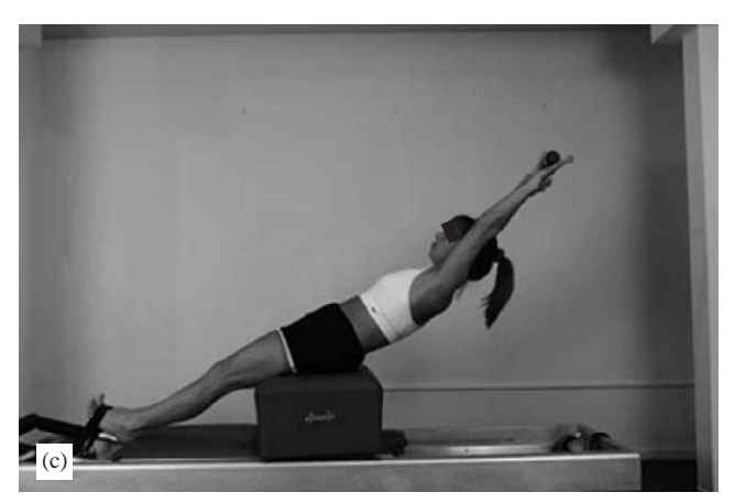
Figure 3 Flat Back on the Short Box Series: (a) demonstrates the starting position of The Flat Back exercise; (b) and (c) demonstrate the trunk being brought in a posterior direction with a straight (flat) back. The second phase of the exercise would be to return to the starting position. The Flat Back on the Short Box is a direct Pilates Apparatus exercise for the powerhouse. It is done on the apparatus called the Reformer. The actual movement is at the hip joints. During the first phase on the way down, the client posteriorly tilts her pelvis at the hip joint (working her hip flexors eccentrically); during the second phase on the way up she anteriorly tilts her pelvis at the hip joint (working her hip flexors concentrically). Just as in old-fashioned straight-leg sit-ups, the anterior abdominals must isometrically contract to hold her trunk straight (since gravity would otherwise collapse her trunk into extension). This is another direct powerhouse exercise. However, above and beyond the effort expended by the anterior abdominals to keep the trunk straight, the focus is on maintaining the powerhouse posture of navel to the spine and up. Indeed, a critical aspect of this exercise is to constantly be reaching up to the ceiling, lengthening the spine as the movement occurs.