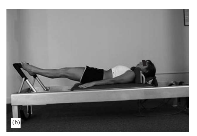
Figure 6 Footwork: (a) demonstrates the starting position of The Footwork Exercise; (b) illustrates the extended position attained by pushing against the bar with one's feet. The second phase of the exercise would be to return to the starting position. The Footwork exercise is an indirect Pilates Apparatus exercise for the powerhouse. It is done on an apparatus called the Reformer. In the initial phase of the exercise, the client pushes her feet against a bar. The force that she creates pushes her body away from the bar. This movement occurs against the resistance of springs that are attached to the board that her body is lying on. In the second phase of the exercise, she then returns to the initial starting position in a controlled manner (resisting the force of the springs to pull her back to the starting position). This exercise requires concentric contraction of knee and hip joint extensors for the initial phase and then eccentric contraction of the same muscles for the second 'return' phase of the exercise. Again, the apparent purpose of this exercise seems to be to strengthen extensors of the hip and knee joint. However, constant attention is being paid to the proper maintenance of the powerhouse posture during these lower extremity movements, by focusing on lengthening the spine by bringing the navel toward the spine and up toward the head. There are a series of these footwork exercises that change the position of the foot upon the bar so that the toes, arches or heels are in contact with the bar.

When assessing the wide breadth of Pilates exercises, two broad categories may be viewed: category one includes those exercises whose sole purpose is to attain and create the Pilates Powerhouse Posture by directly addressing and working