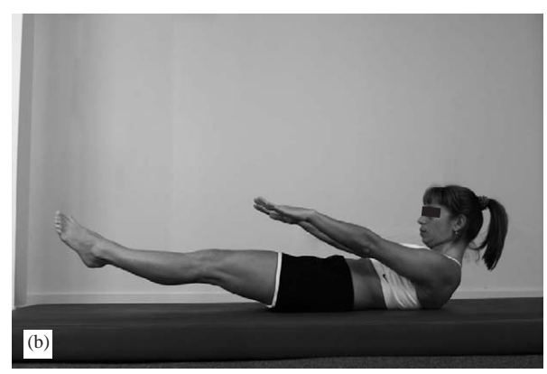
Figure 1 The Hundred: (a) demonstrates the starting position of The Hundred; (b) illustrates the upward movement of the arms that is done during The Hundred. The Hundred is an indirect Pilates Mat exercise for the powerhouse. In The Hundred , the client moves her arms up and down sequentially (between the position seen in (b) and the position seen in (a). These movements of flexion and extension of the arms at the shoulder joints are done while maintaining a static posture of neck flexion at the spinal joints and thigh flexion at the hip joints. These arm movements are repeated 100 times, hence the name. This is a Pilates mat exercise that is usually done at the beginning of a workout. While the intent seems to be to concentrically and eccentrically work the sagittal plane muscles of the arm at the shoulder joint (along with isometrically working the anterior neck and hip joint muscles, as well as being a cardiovascular warm-up); strict attention is always being paid to isometrically maintain the Pilates powerhouse posture. Toward this end, the focus is on isometrically engaging the abdominals, pressing the navel to the spine and lengthening up in a cephalad direction. This exercise may also be done using apparatus, and there are alternate versions of the hundred that are easier to perform.

as stabilizers, the Pilates Powerhouse Muscles. It is these key muscles at the core of the body that ultimately prove to be the key to health and stability.