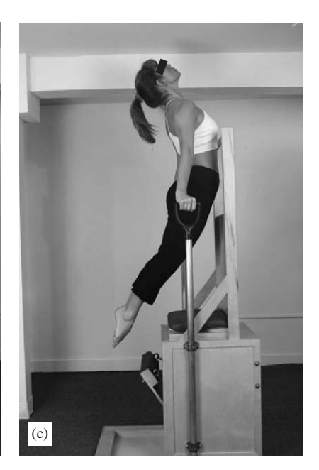
Figure 8 Press-Up Bottom: (a) demonstrates the starting position of The Press-Up Bottom Exercise; (b) illustrates the first step of raising the body up toward the ceiling. (c) Illustrates the final step of arching the body back into extension. The second phase of the exercise would be to return to the starting position by pushing the pedal back down. The Press-Up Bottom exercise is both an indirect and direct Pilates Apparatus exercise for the powerhouse. It is done on an apparatus called the Electric Chair. In the first phase of the exercise, the client begins on a pedal that is attached to springs. The first step requires the client to concentrically contract the extensors of the elbow joint, pushing the body up into the air; this movement is aided by the tension of the springs. While this step of the Press-Up Bottom exercise may appear to be simply a vertical version of a push-up exercise aimed at strengthening elbow joint extensors, the Pilates instructor is constantly looking for the client to hold the Pilates Powerhouse Posture by pulling the navel to the spine and lengthening the spine upwards. Pilates instructors often instruct their clients to think of the lifting force for the body as coming from the powerhouse, in effect marshaling the force from the powerhouse to 'levitate' their body. This first step could be considered to be an indirect exercise for the powerhouse. The second step requires the client to concentrically contract the extensors of the spine, creating extension of the trunk at the spinal joints as well as anterior tilt of the pelvis at the lumbosacral joint. As such, this step is a direct powerhouse exercise, specifically a concentric strengthening exercise of the spinal extensors. The return phase of this exercise requires the client to precisely maintain the powerhouse posture while returning to the starting position, pushing down against the springs of the pedal.

focusing on another part of the body where motion is being directed to occur, but meanwhile the underlying focus and intent is directed just as much, if not more so, toward the stabilizing contractions of the muscles of the powerhouse, and therefore, maintenance of the Pilates Powerhouse Posture. Generally, category one incorporates those exercises that create concentric and eccentric (and isometric) contractions of powerhouse muscles while category two incorporates those exercises that create isometric contractions of powerhouse muscles, while concentric and eccentric (and occasionally isometric) contractions are occurring in other regions of the body. Category one exercises may be termed Direct Powerhouse Exercises and examples of these are seen in Figs. 2— 5. Category two exercises may be termed Indirect Powerhouse Exercises and examples of these are